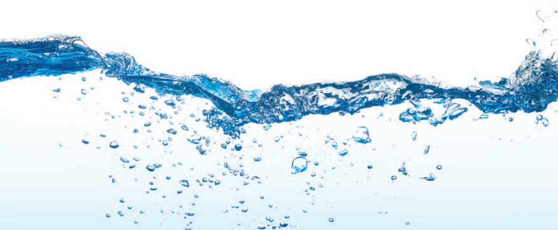
Water Treatment & Hygiene